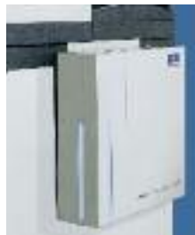
AuCS - SO (External Mounting)