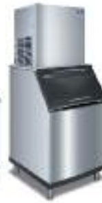
RF-0650 B-570 Bin