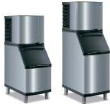
S-322 B-320 Bin