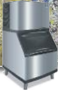
S-450 B-400 Bin