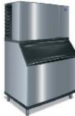
S-1600 B-970 Bin