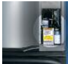
AuCS - SI (Internal Mounting)