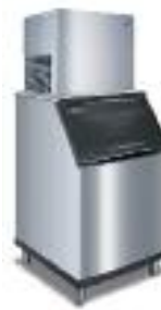
RF-0300A B-570 Bin