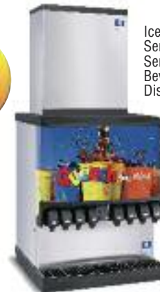
Ice/Beverage Series on Servend Beverage Dispenser

Ice machine and dispenser ordered separately