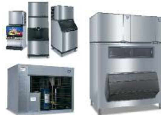
CVD Condensing Unit***