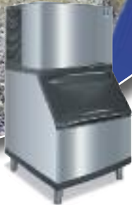
S-500 B-400 Bin