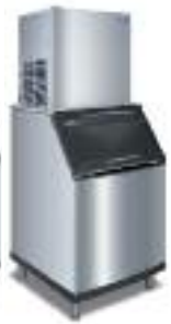
RF-1200 B-570 Bin