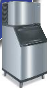
S-600 B-570 Bin