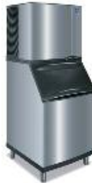
S-850 B-570 Bin