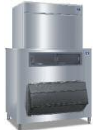
S-1800 B-970 Bin