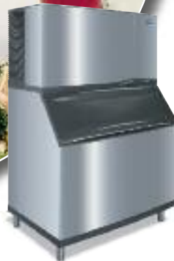
S-1400 B-970 Bin